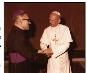
Archbishop Oscar Romero with Pope Paul VI

On the death of Pope John XXIII, Giovanni Battista Montini was elected June 21, 1963 to succeed him. In his first message to the world, he committed himself to a continuation of the work begun by John XXIII. Throughout his pontificate the tension between papal primacy and the collegiality of the episcopacy was a source of conflict. On September 14, 1965 he announced the establishment of the Synod of Bishops called for by the Council fathers, but some issues that seemed suitable for discussion by the synod were reserved to himself. Celibacy, removed from the debate of the fourth session of the Council, was made the subject of an encyclical, June 24, 1967); the regulation of birth was treated in Humanae vitae July 24, 1968), his last encyclical. The controversies over these two pronouncements tended to overshadow the last years of his pontificate.